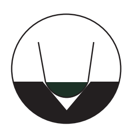
Hyper Conical Stylus